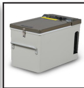
Remote Power - † DC Compatible Devices