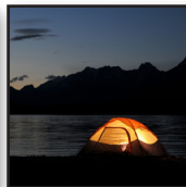
Remote Power - Camping - Lighting, etc.