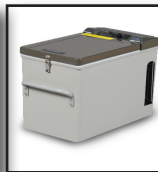
Remote Power - † DC Compatible Devices