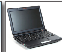
Remote Power - Netbook Charging