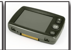
Remote Power - GPS Systems

Note - some applications may require additional accessories. Example - PowerFilm recommends use of an inverter and battery for laptop charging.