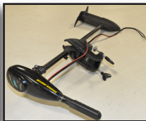
Remote Power - Trolling Motor