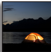
Remote Power - Camping - Lighting, etc.